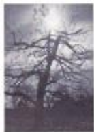
Westford Land Preservation Foundation, Inc.

Private funds will play a critical role in conserving the Camps for future generations. Please join your neighbors in making this property part of your legacy. Your tax-deductible donation will help make this goal possible. Contributions can be sent to the Westford Land Preservation Foundation at P.O. Box 235, Westford, MA 01886. Please make checks payable to the "Westford Land Preservation Foundation" and note on your check that your gift is for East Boston Camps.